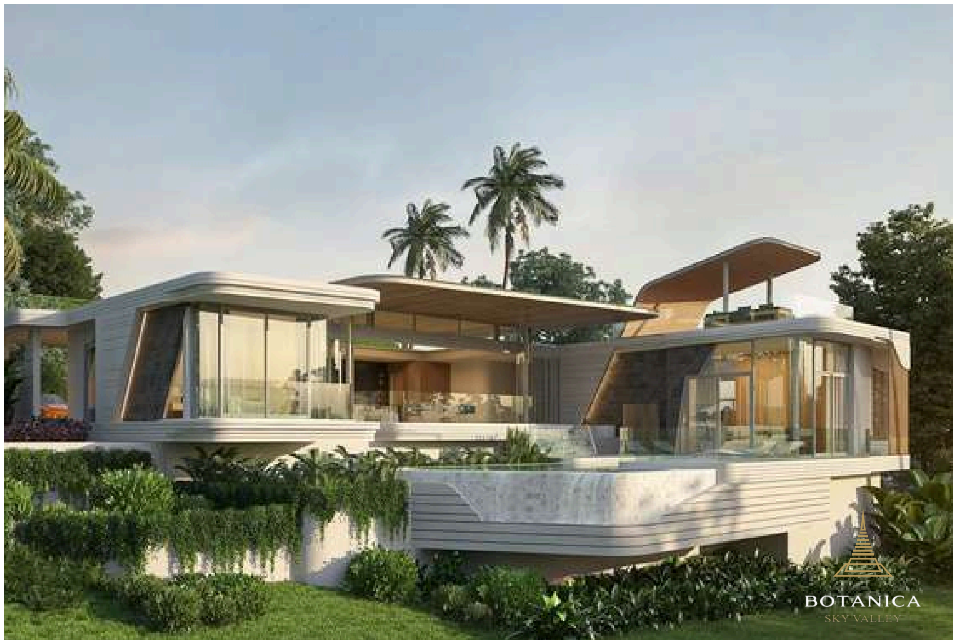
Botanica Sky Valley